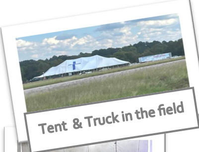
Tent & Truck in the field