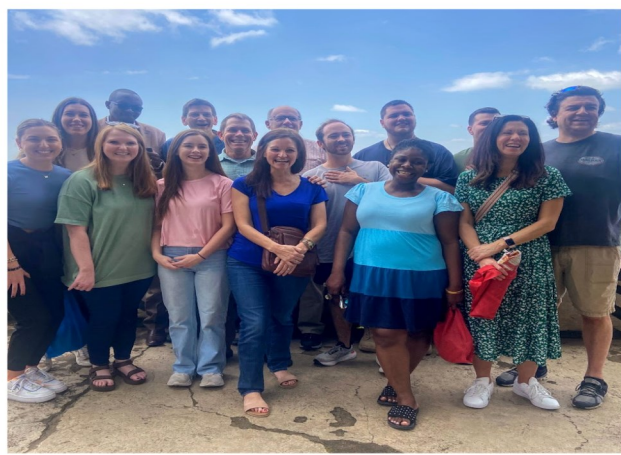
Mission Team in Kenya